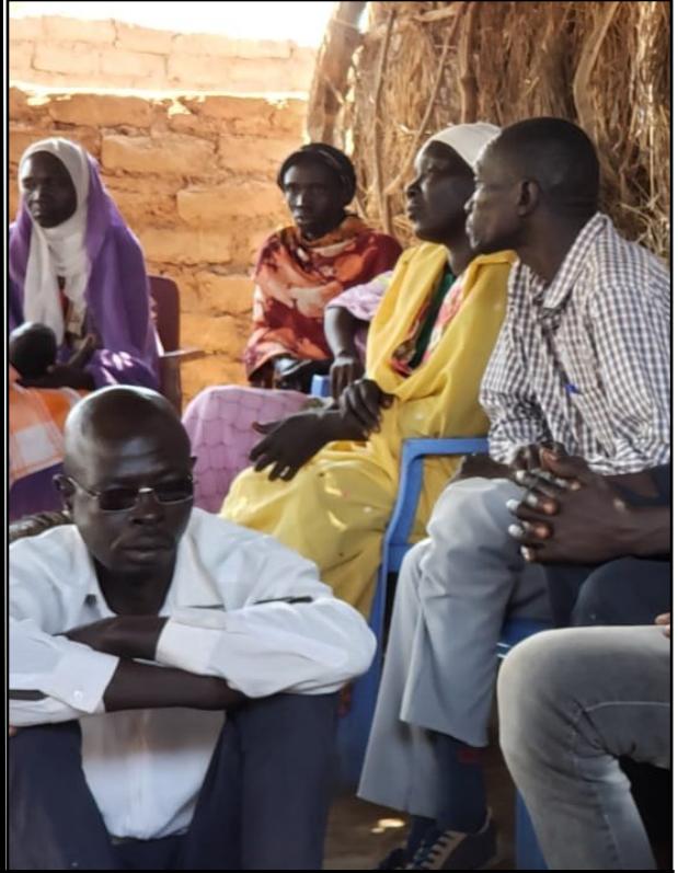
Refugee Camp in South Sudan see page 10